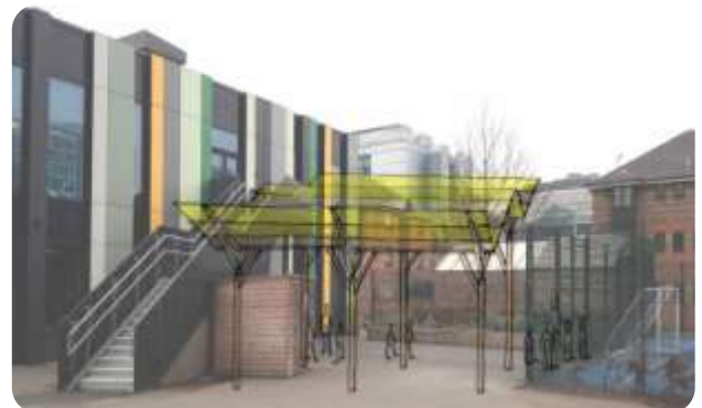
What one of our new canopies might look like

The works will be scheduled for the summer break, to ensure all pupils are able to enjoy the benefits of the new structures at the start of the new school year.