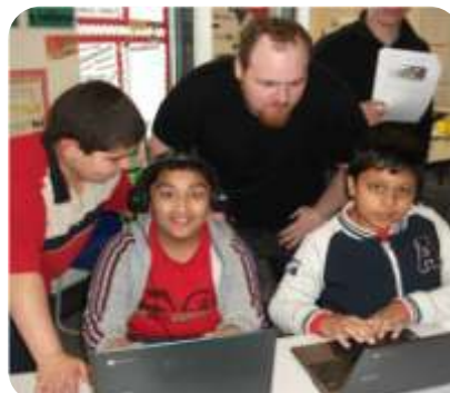
A friendly volunteer giving assistance

Each session lasts an hour and the pupils meet weekly with the volunteers for approximately 10 weeks, dependent on term length.